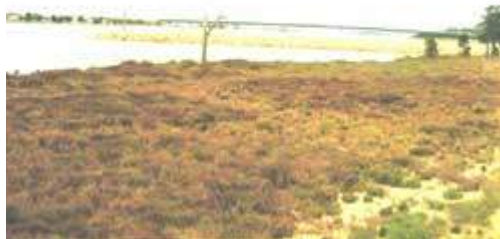
Samphire at Entrance Canal. Note new wall out into estuary