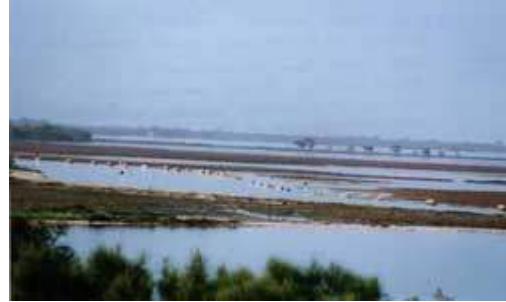
Separation canal flooding the wetland