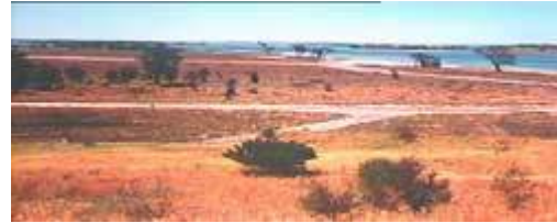
Samphire across to Creery Island