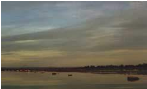
...will not be able to survive.