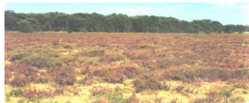
Samphire in flower. Swamp oaks to give way to canals

Late sixties-early seventies first residential canal estate started at Sth Yunderup opening into Peel Inlet at mouth of Murray river.