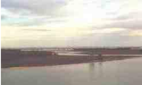
There is some suggestion...

Early morning photos taken by Griselda Hitchcock, June 2001