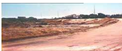
Work on Area A