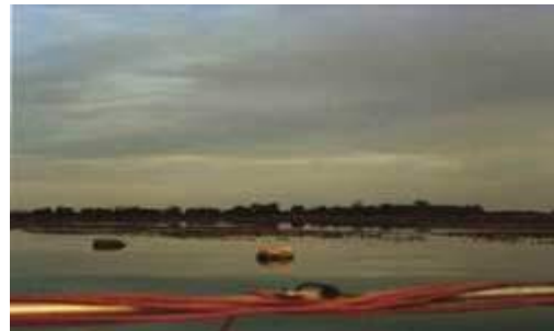
but surely the samphire...