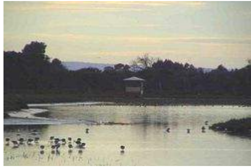
View across to bird hide