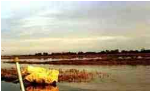
from having constant shallow water here..