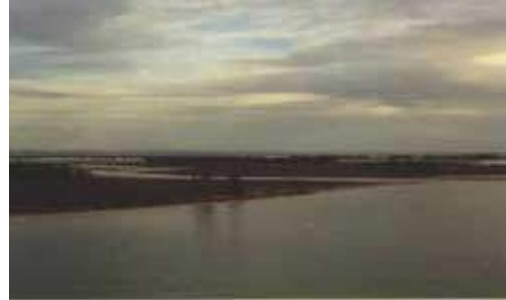
that wading birds will benefit...