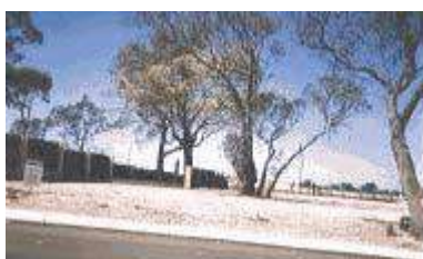
Tuart dying due to salt intrusion after de-watering March 2000