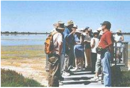
Group at Creery wetlands