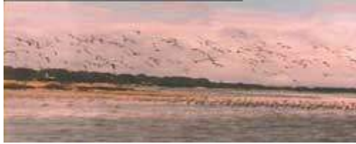
Birds flying over Creery Wetlands